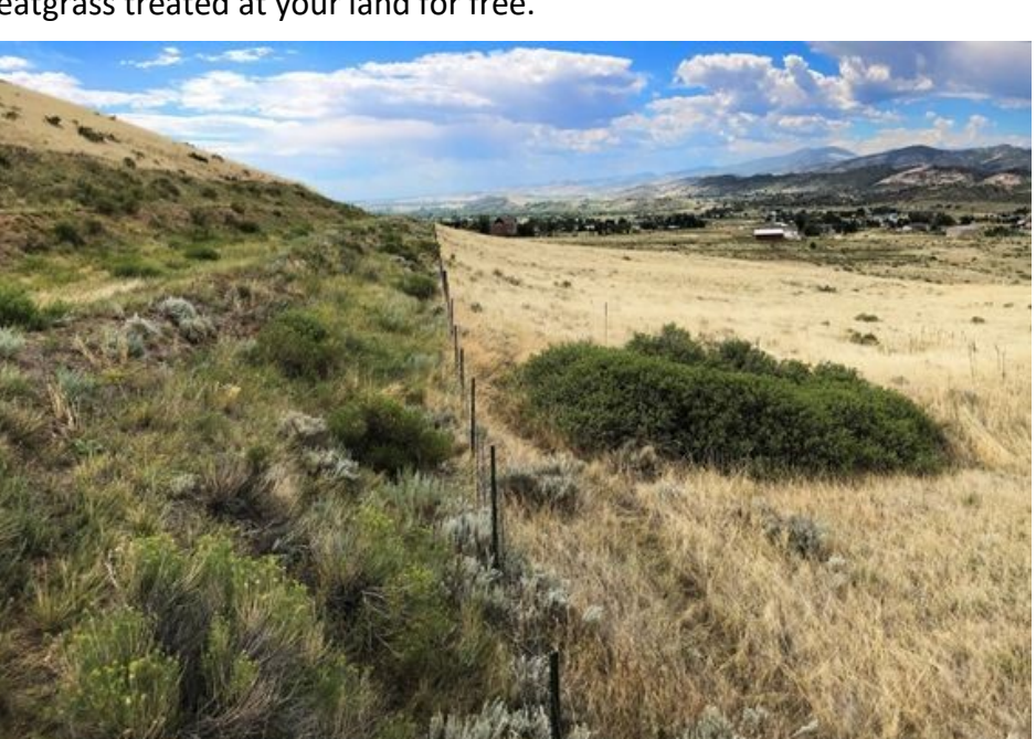
Image (right) of a annual invasive grassland (cheatgrass) on the right side of the fence, and an intact shrubland on the left side of the fence after cheatgrass was treated with Rejuvra.

Landowner permissions have been secured and treatment will occur on State you have any interest in having cheatgrass treated at your land for free.